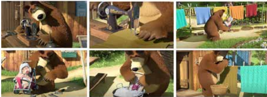
Positive educational messages (Laundry Day)